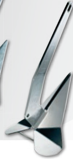
Stainless Steel Delta® Anchor