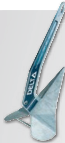
Galvanized Delta® Anchor

Consistent and reliable in performance, the Delta® anchor is guaranteed for life against breakage 1 , has Lloyd's Register General Approval of an Anchor Design 2 as a High Holding Power anchor and is specified as the primary anchor used by numerous National Lifeboat organizations.