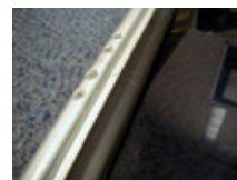
Lid Profile Mark 1 & 2