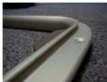
Flanged Lower Frame