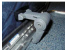
Optional Friction Stay Kit available